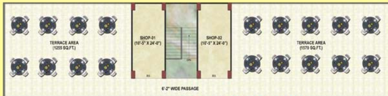
AREA STATEMENT OF SECOND FLOOR SHOPS